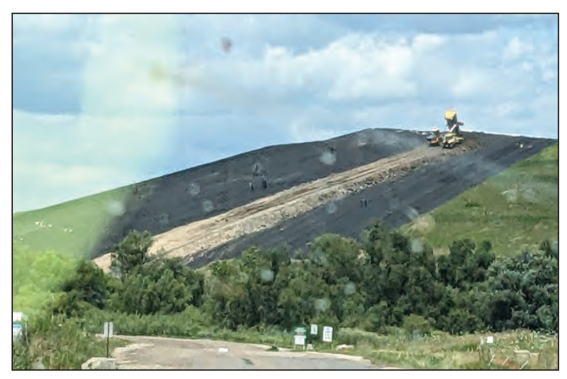
Soil pushed ahead of equipoment to protect cap