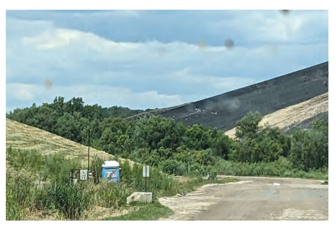
Plastic cap and geocomposite awaiting more clay on West slope on masss