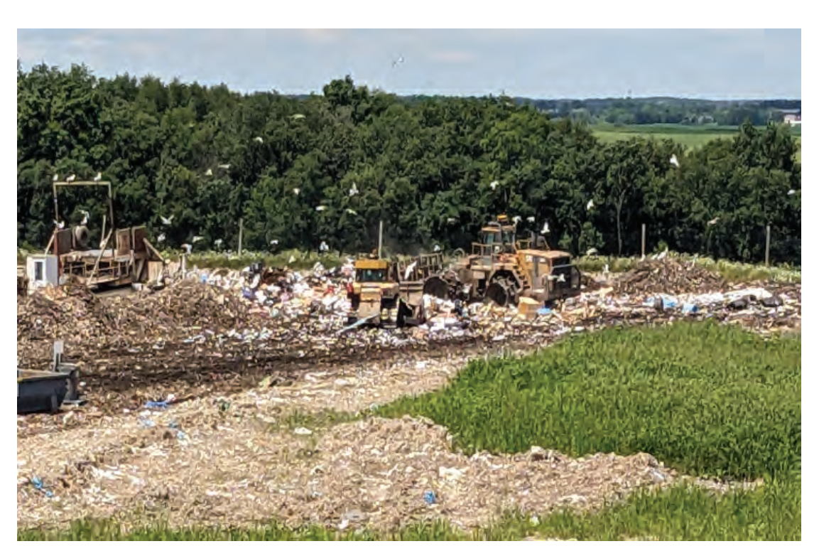
Working face covering for the day