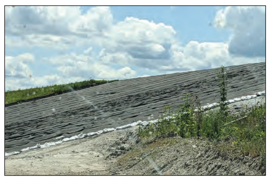
Plastic cap and geocomposite awaiting more clay on East slope on masss