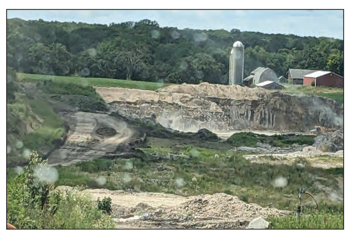
Borrow area providing clay for cap over plastic cap placement